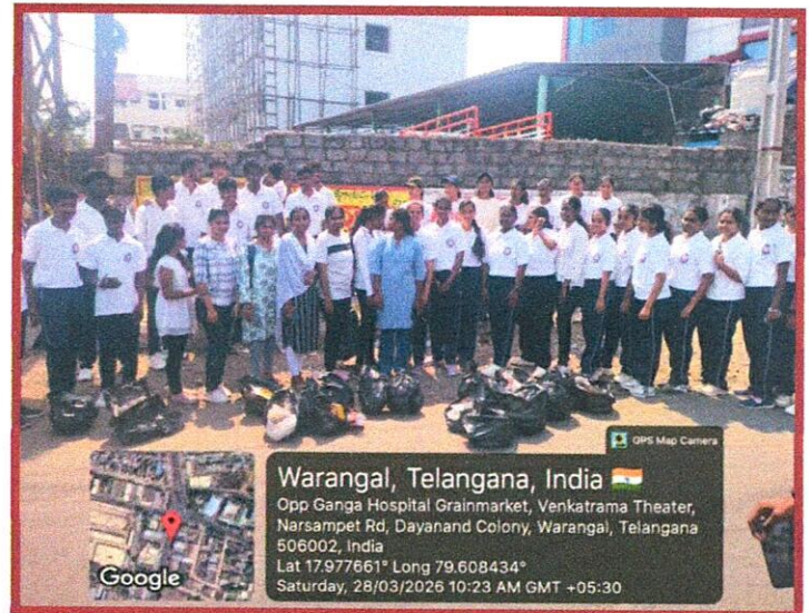
Caption: Say no to plastic, yes to a cleaner future.